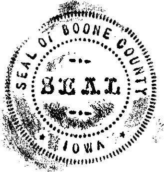
Exhibit A - Attached